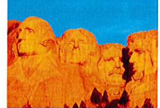
U.S. Presidents Immortalized in stone at Mt. Rushmore