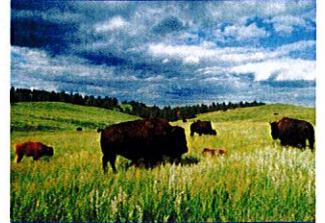
Wildlife enhances the pristine Black Hills