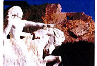
Crazy Horse Monument to be 10x the size of Mt. Rushmore