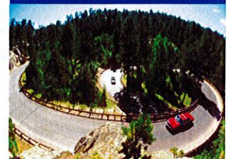
Spectacular view traveling the famous Black Hills