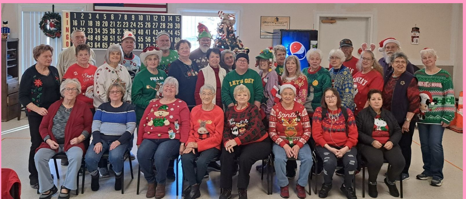
Fit & Fall class Christmas Party 2023

You can play Bingo at the Center on Mondays at 1:00. The cost of each card is $1.00.